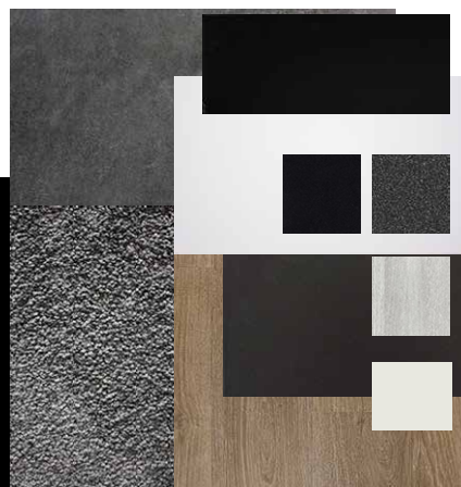
CLASSIC BLACK AND WHITE

SHORT ON TIME OR JUST LIKE OUR STYLE? Choose one of our Spectrum Home Design Packs.