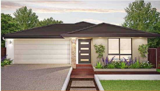
COMFORT 1 OR 2*